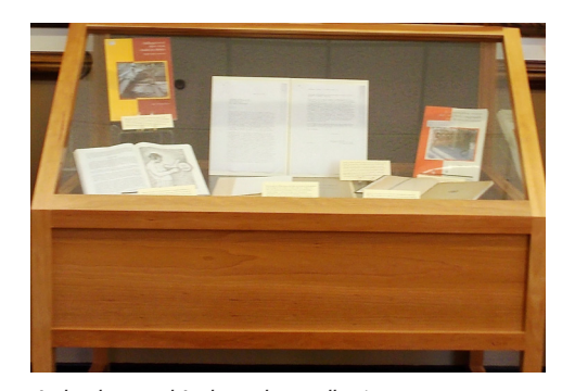
Archeology and Anthropology collection