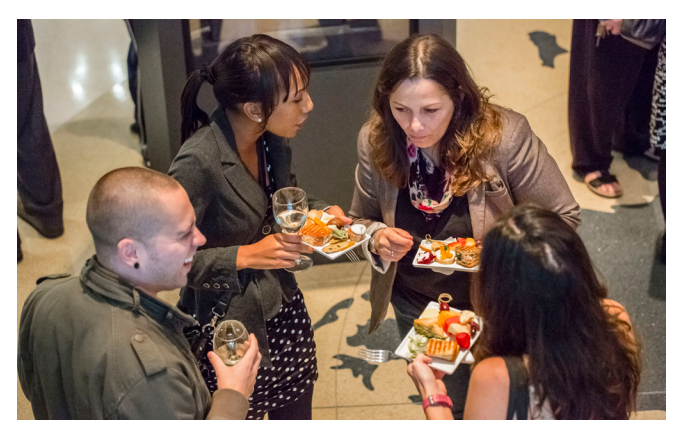
CLACS graduate students