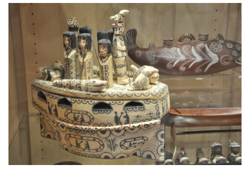
"Phanton Boat", Wounaan Artist

In the center case all of the items on display received a good deal of attention. One of these is the "Sacha Runa" sculpture made by a nonindigenous artist from Quito, who brings his knowledge of festival activity in the Central Andes of Ecuador to bear on this captivating piece. "Sacha Runa" in Amazonia refers to "forest people." In the Central Andes a few nonindigenous people dress up in Spanish moss and palm fronds, covering themselves from head to foot, and then attend indigenous festivals where they hide behind bushes or large maguey plants and leap out with arms upraised to frighten participants and visitors alike. It is said that when the Sacha Runa comes from Amazonia to Andes special shamanic powers of disruption and inversion of social order are released.