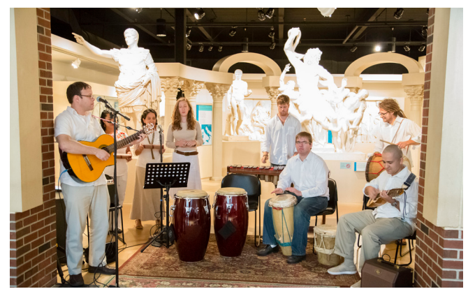
Del Sur and Costas performance