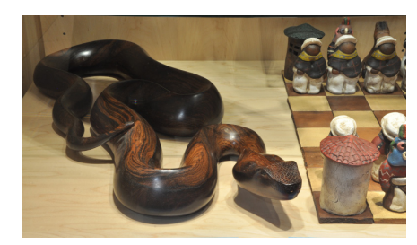
"Cocobolo anaconda", Wounaan artist

After viewing this exhibit many visitors to the museum moved to the adjacent Gallery of South American Peoples to gain a deeper understanding of the cultural depth and breadth of the products of peoples' creativity throughout South America. A highly significant feature of the permanent gallery is that, wherever possible, the images portrayed are connected directly to real people in real places.