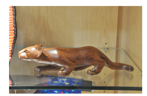
"Cocobolo Jaguar", Wounaan artist

The same people who live in the Darién Province of Panama, part of the Pacific Lowlands shared with Colombia and northern Ecuador, also made the Cocobolo-wood jaguar of the upper right corner and the anaconda of the lower left, both manifestations of spirit masters of the tropical forest "living ecology."