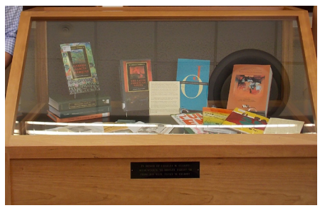
Languages and Literature collection

C: Student interest in the Latin American and Caribbean collection tends to reflect course topics and coursework assignments. Additionally, use of the collection depends greatly on students' language abilities. While some of the collection is in English, namely US and British imprints, most is in Spanish, Portuguese or a Latin American or Caribbean indigenous language. Thus only students knowledgeable in these languages can fully use the collection and take advantage of its breadth and uniqueness. When I was the interim Latin American and Caribbean librarian (2008-2012), I tended to see Spanish and Portuguese speaking students using the collection. Their interest varied wildly, from Brazilian economics to Mexican pottery. (cont pg. 25)