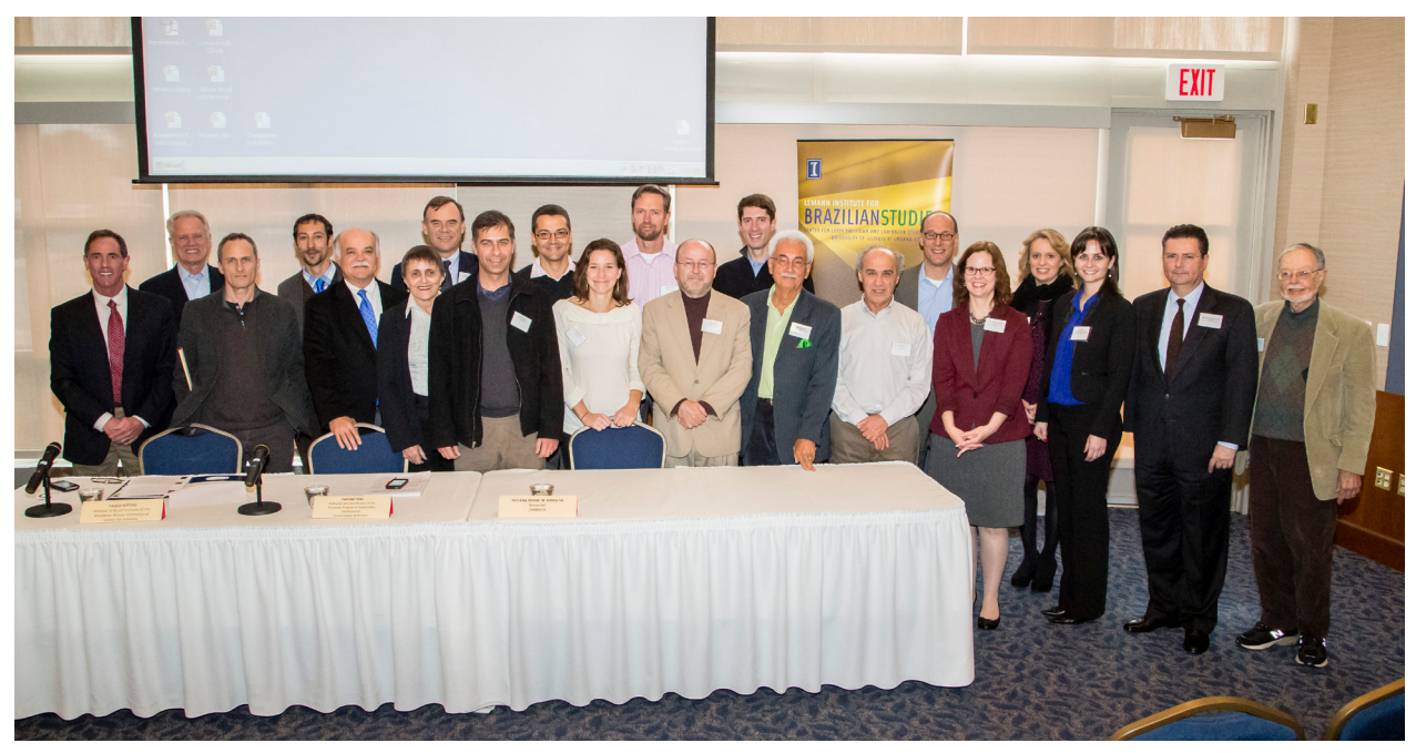
Third Annual Lemann Dialogue on Agriculture and Environmental Issues in Brazil. November 7-8, 2013

On November 7 and 8, the Lemann Institute hosted the Third Annual Lemann Dialogue, at the Alice Campbell Alumni Center. The theme of this year's Dialogue was "Agricultural and Environmental Issues in Brazil." The Dialogue included the following 6 panels: Agribusiness: Achievements and Challenges; Land Distribution; Impact of Biofuels Production on Labor and Land Use; Environmental Implications of Development; Climate Change; and Natural Resource Management: Wood and Water.